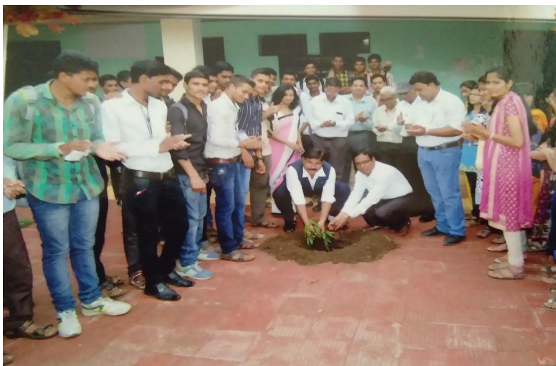
Plantation Programme executed by Dept.