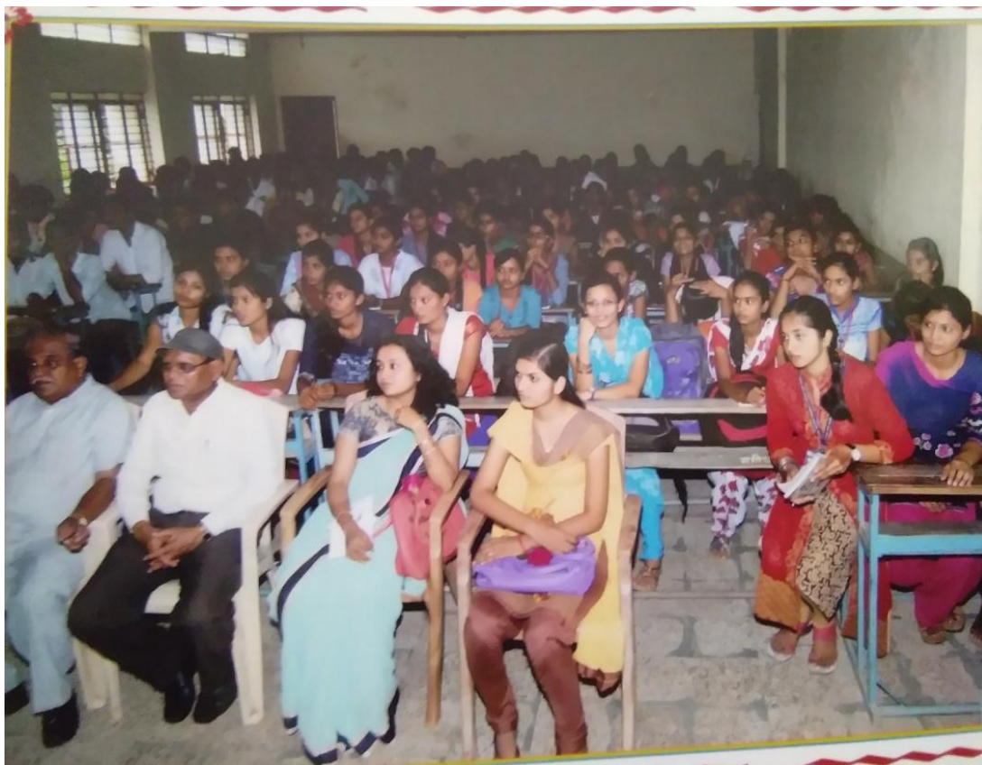
Participant attending the Career counseling program