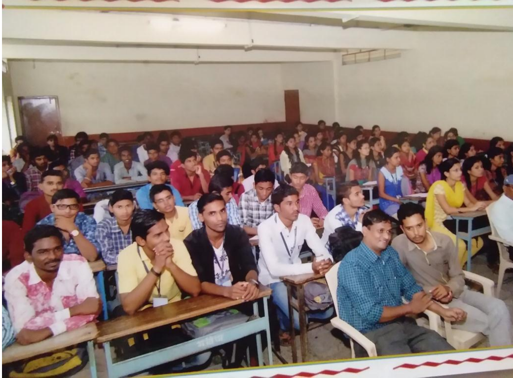
Participant attending the Program “make in India”