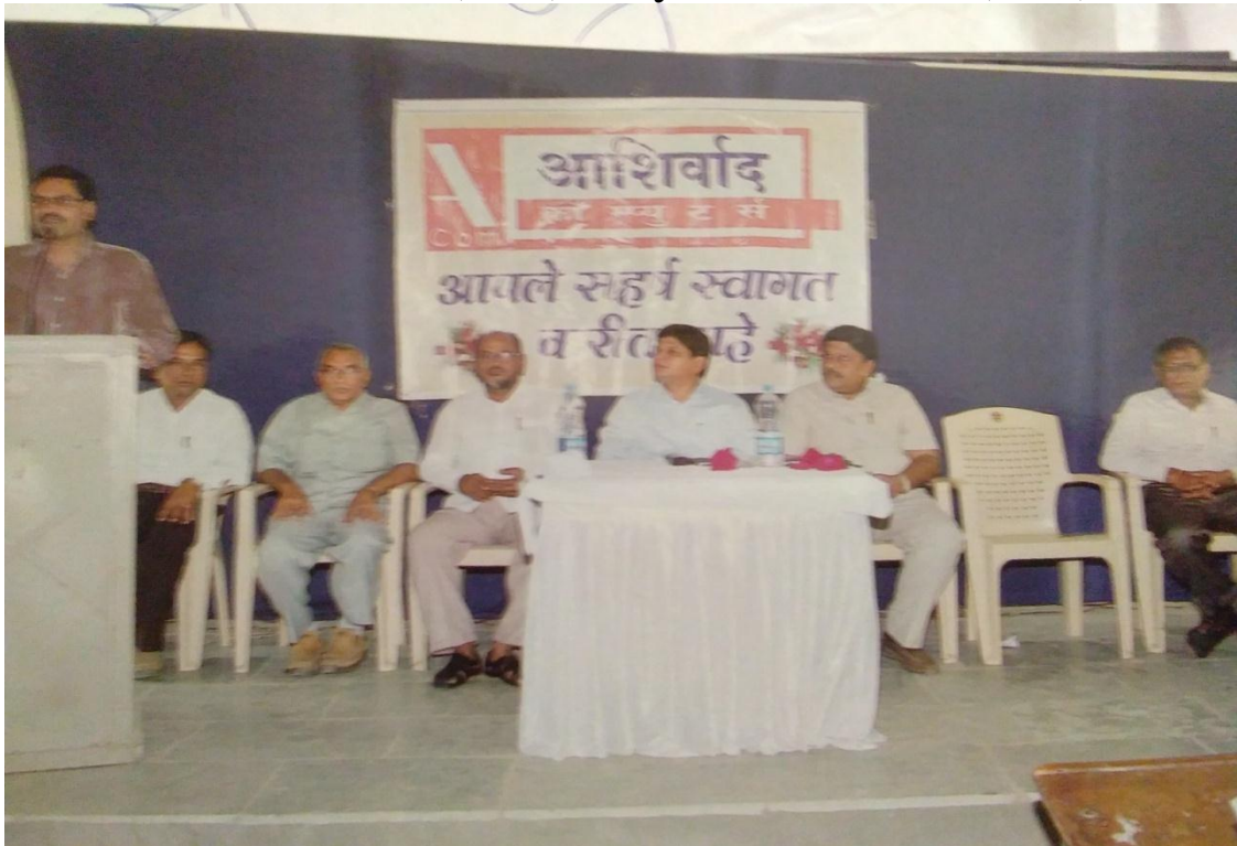
Inauguration of Commerce Association